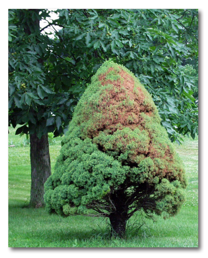
Spider mite feeding on conifers can cause significant, permanent damage to the foliage.

Early identification of spider mites can prevent major damage to individual plants and prevent the spread to nearby trees and shrubs. Depending on the time of year and the species of mite, there are several different management options available.